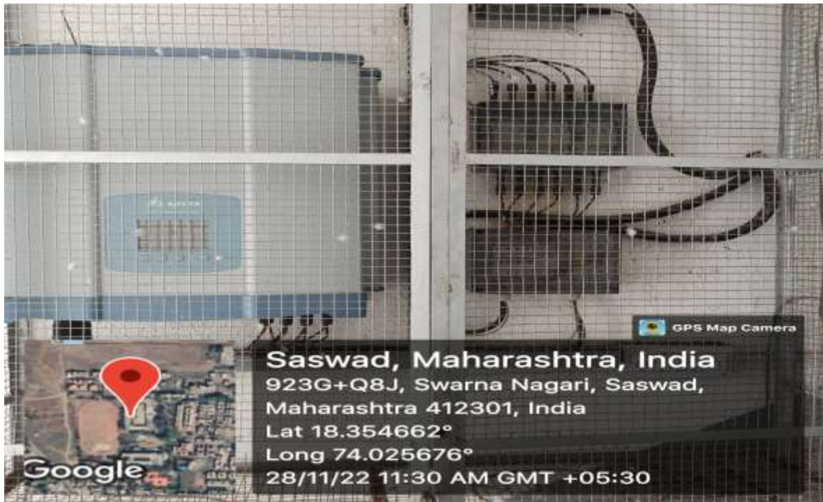
Solar Panel Meter