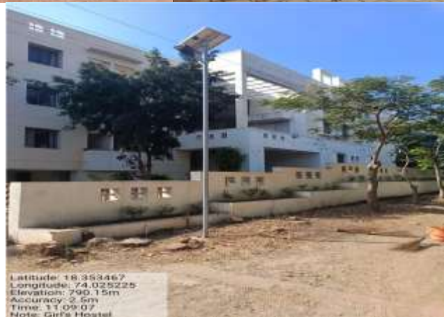
Solar lamp Infront of girls' hostel