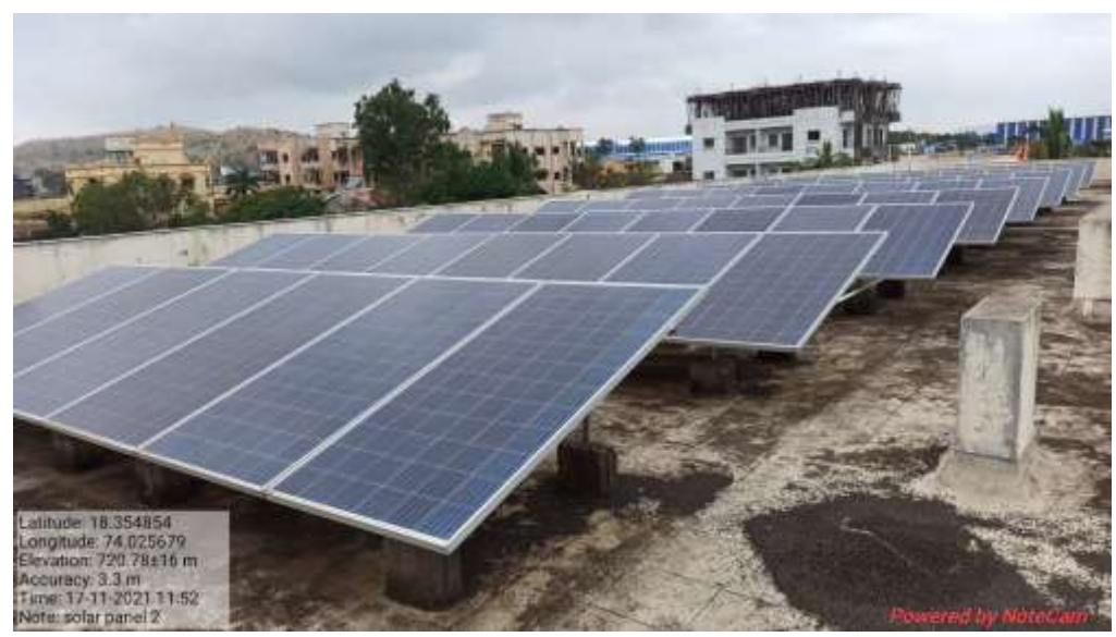
Solar panels mounted on roof