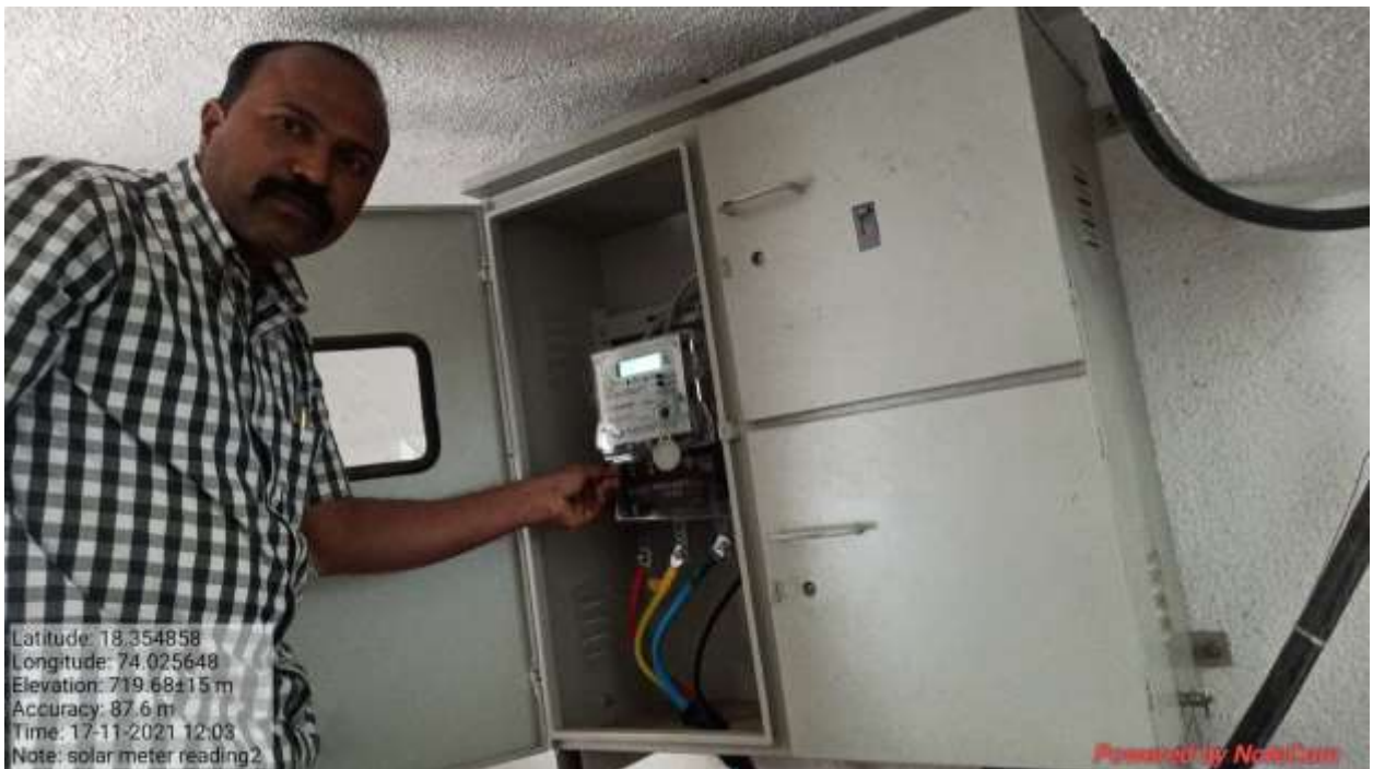
Solar panel meter

Latitude: 18.354858 Longitude: 74.025648 Elevation: 719.68±15 m Accuracy: 87.6 m Time: 17-11-2021 12:03 Note: solar meter reading2